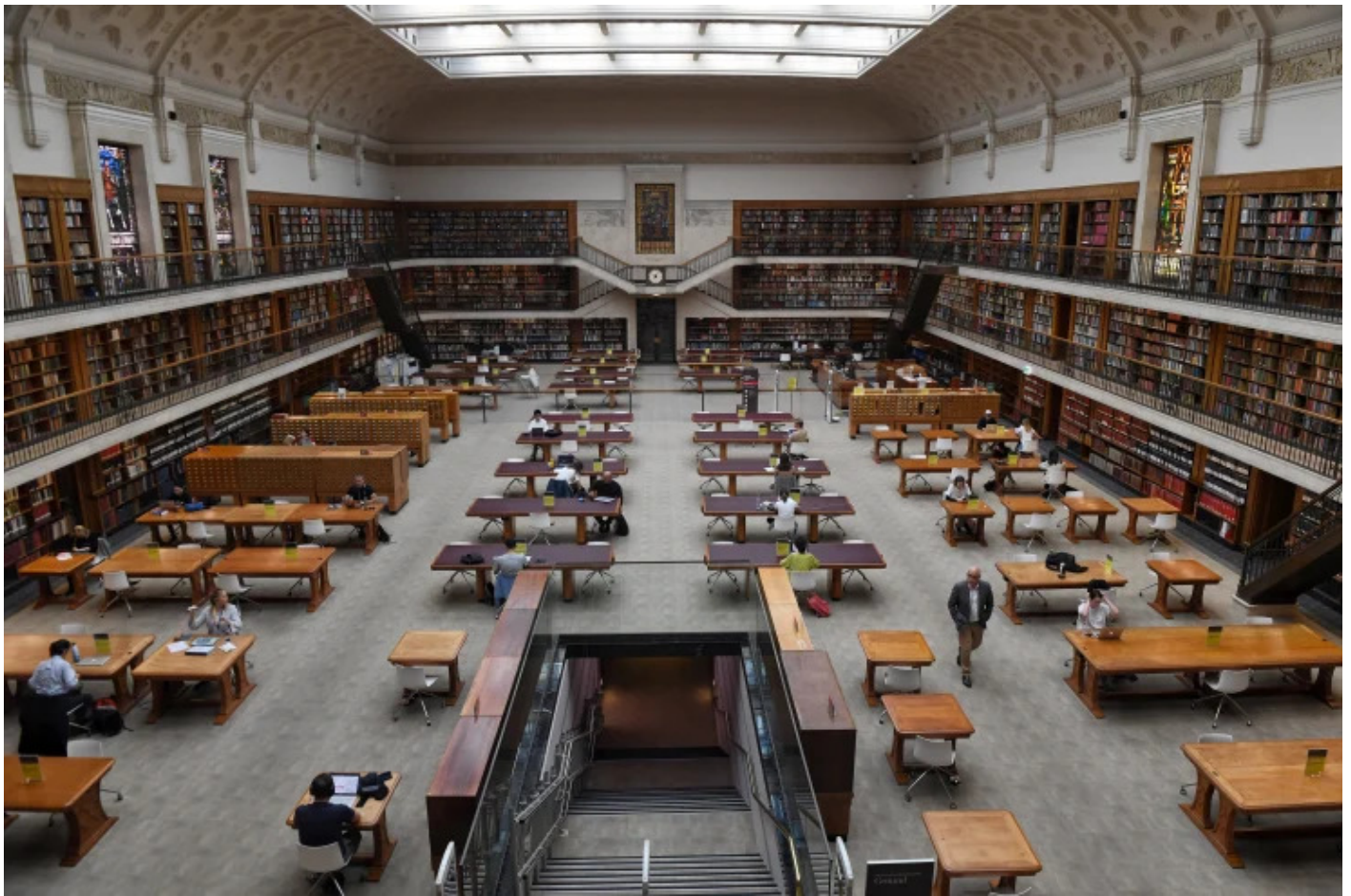
The new auditorium will be built underneath the Reading Room.